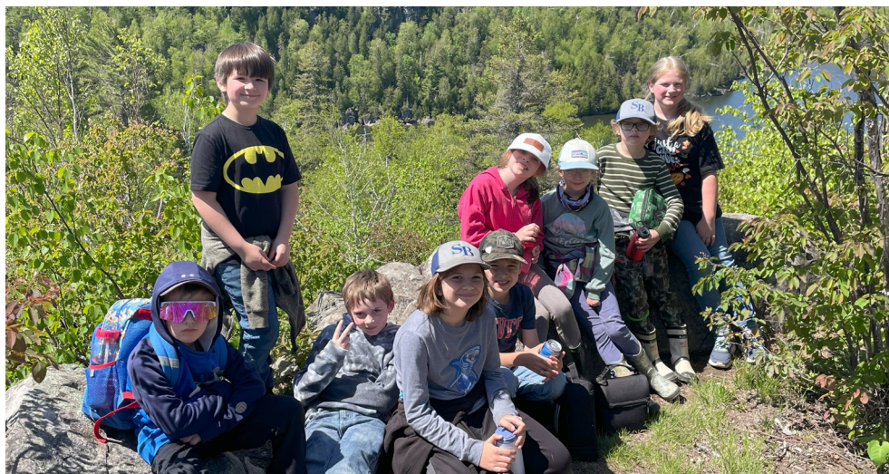
WILLIAM KELLEY ELEMENTARY, SILVER BAY MN