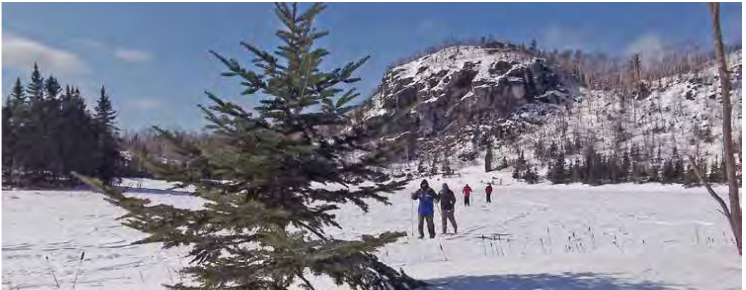
Skiing Raven Lake trails.

Classes saw upgraded binoculars, compasses, infrared thermometers, climbing ropes, Vernier optical dissolved oxygen and pH probes to name a few things. Cross Country Ski Class was completely re-outfitted with brand new Fischer skis, boots, and poles. Summer programs benefited with added kayaks, a new canoe/kayak trailer, and tents.