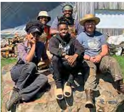
Some of the 2023 Wolf Ridge Farm Family.

The Minnesota Association for Environmental Education bestowed the Wolf Ridge with their 2022 Partner of the Year Award. This award is made to an organization that has made significant contributions in advancing environmental education in Minnesota.