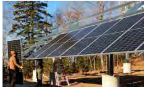
Installing the new solar array.

With COVID, Wolf Ridge expanded its teaching repertoire to include virtual learning. Three Wolf Ridge staff teamed up to conduct a webinar for Minnesota Outdoor Skills and Stewardship Series (MOSSS) hosted by the MN DNR. Over 700 registered participants learned about animal tracks and the practice of tracking in the snow. Feedback in the comments was very positive with remarks like, "That was a great presenta-