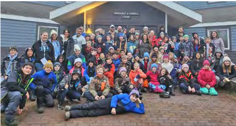
La Ola del Lago Spanish Immersion School, Prior Lake.

Oak Crest Elementary Oak Hill Montessori Community School Onamia Junior High Our Lady of Grace Catholic School Our Lady Of The Lake Our Village School Park River Area School Pequot Lakes Middle School Phoenix Learning Center Ponemah School Prairie Creek Providence Academy Redtail Ridge Elementary River Grove Elementary Roseau School District Sacred Heart-East Grand Forks Sawtooth Mountain Elementary School of St Philip Schoolcraft Learning Community Shakopee High School Shell Lake School District Shirley Hills Elementary Sierra Club Solon Springs School St Anthony Park Elementary St Charles Borromeo St Croix Catholic St Croix Preparatory Academy St Francis De Sales St John's Lutheran School St John School of Little Canada St John the Baptist St Jude of the Lake St Mary's School - Breckenridge St Mary's School - Morris St Patrick School St Paul's School St Peter's School St Philip's School St Rose of Lima St Stephen's School St Therese of Deephaven St Thomas More Catholic School Stella Maris Stowe Elementary Trinity Lutheran/Our Lady of the Prairie TRIO Upward Bound - Anoka-Ramsey Community College Triton High School Two Harbors High School US Forest Service UW - Superior Upward Bound Warroad Middle School Washburn Middle School Watershed High School Watertown - Mayer MS Westwood Elementary Wheaton College - Honey Rock, IL William Kelley Elementary Willow River Elementary Woodbury Leadership Academy