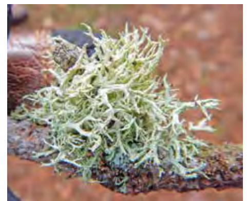
Boreal Oakmoss lichen.

Wolf Ridge has been involved with many different citizen and community science projects over its 50-year history. From taking weather data for the National Weather Service (NWS) to helping the Midwest Peregrine Society in restoring the falcons to the North Shore, Wolf Ridge is always looking to find ways to be a bridge between learners and science. These partnerships build new opportunities for us. Weather monitoring for the NWS influences our Weather Forecasting class. Students in Canoeing class take water clarity data for Wolf Lake using secchi disks for the Minnesota Pollution Control Agency. We are currently working on plans to incorporate air quality monitoring into our curriculum. Like lichen, which are not an individual but a small ecosystem of two or more species working, creating partnerships with Lichen CitiSci and the USFS can lead to the creation of new and exciting things that might not be possible otherwise.