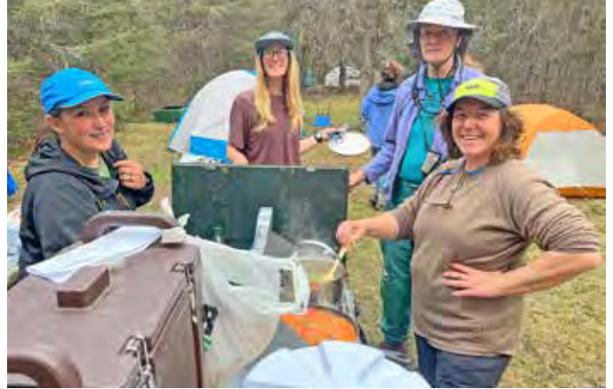
Leave No Trace Level 2 Instructor Course participants cooking up dinner at their campsite.

Fall Adult Weekend: September 27-29: $390/person