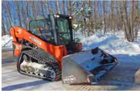
Skid steer in action.