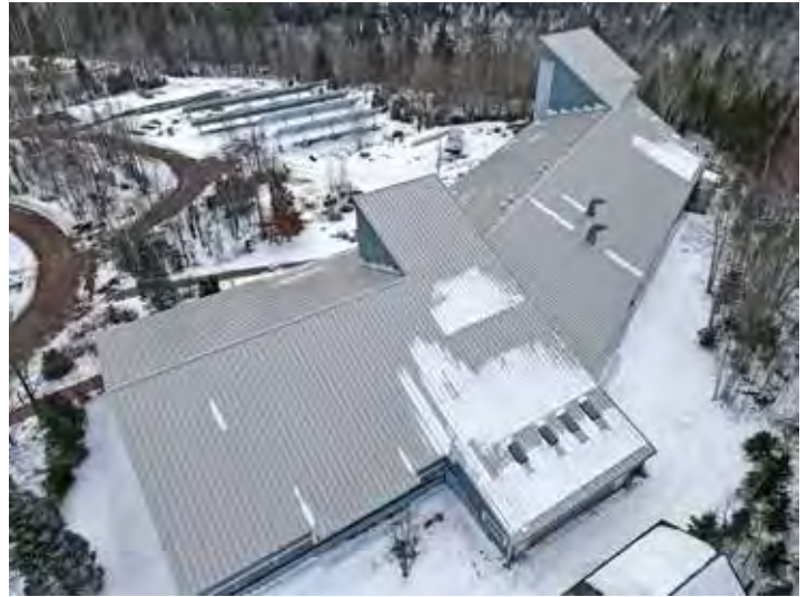
New Science Center roof.

On the farm we replaced the cover on a high tunnel with a new system and built a timber frame addition for cleaning vegetables.