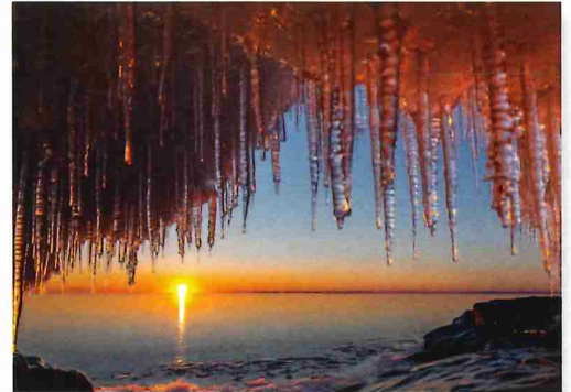
MARCH SUNRISE ICICLES