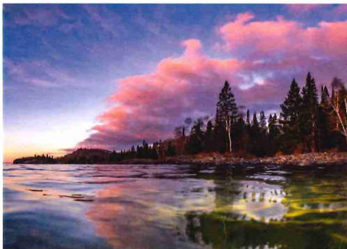
JULY ELLINGSON ISLAND AT POINT