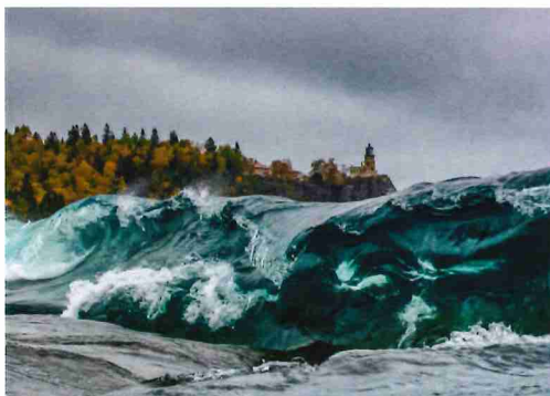
OCTOBER BIG WAVE FALL