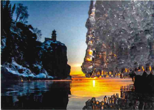
JANUARY BITE OUT OF MORNING