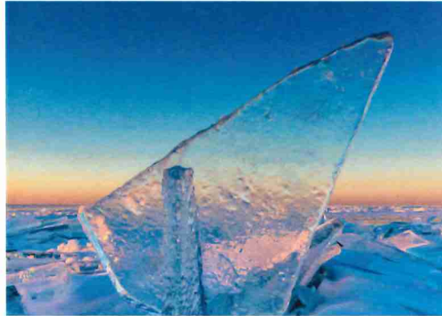
FEBRUARY POINTS NORTH