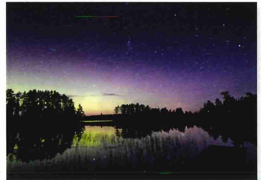
JUNE SHOT IN THE DARK