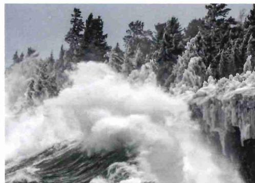
NOVEMBER WAVES AT CRYSTAL BAY