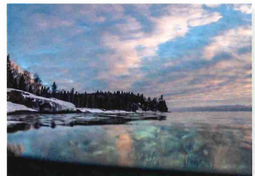
DECEMBER WINTER SPLIT