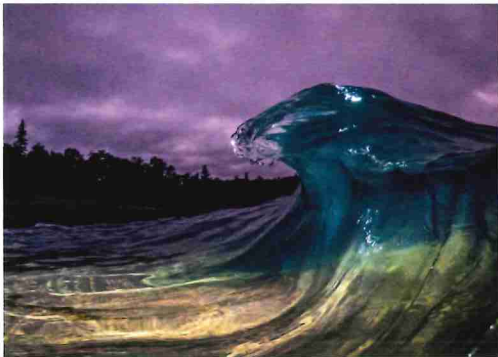
APRIL MORNING NESSIE