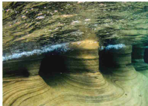
AUGUST BENEATH PICTURED ROCKS