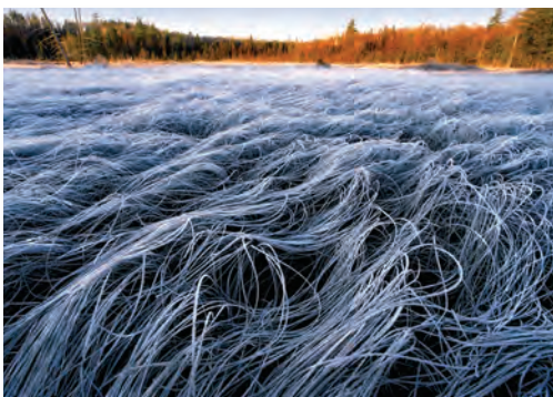
OCTOBER FROST GRASS