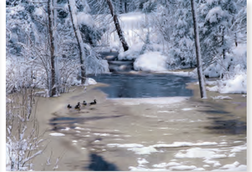
MARCH WOOD DUCKS ON JUDD CREEK