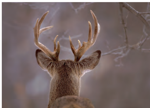
NOVEMBER WATCHING FOR THE WOLF