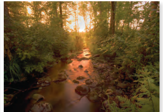
JUNE JUDD CREEK GLOW