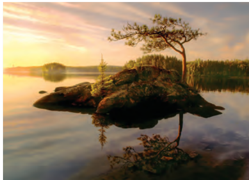
AUGUST OJIBWAY LAKE ISLAND LUSTER