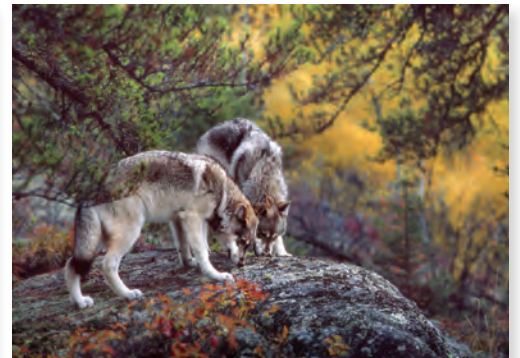
SEPTEMBER WOLVES LICKING ROCK