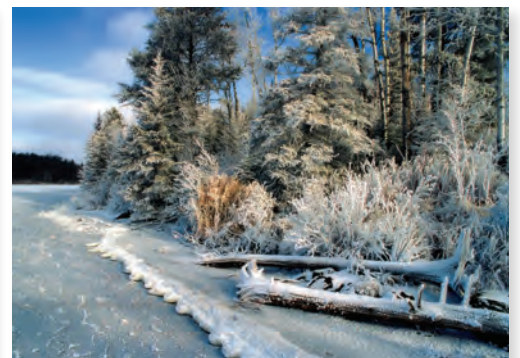
DECEMBER MOOSE LAKE SHORELINE