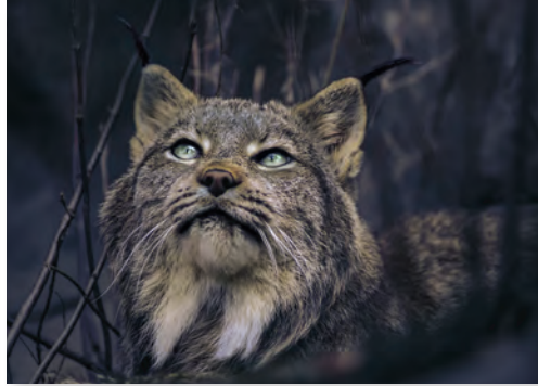
FEBRUARY LYNX KITTEN