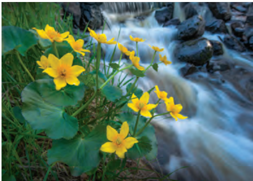
APRIL SPRING DAY, MARSH MARIGOLDS BY JUDD CREEK RAPIDS