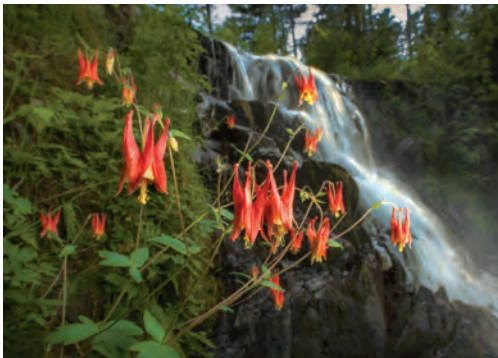
JULY COLUMBINE AT WATERFALL