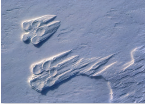
JANUARY ARCTIC WOLF TRACKS