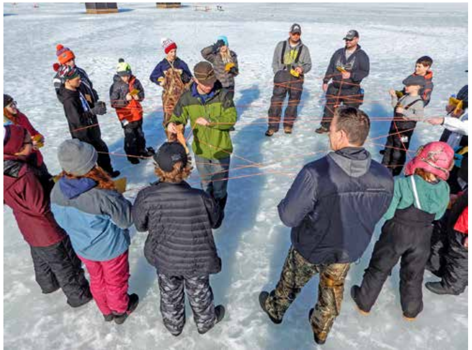
"Everything is connected to everything else." That's the first law of ecology.

Finally, I'd like to share one of my leading lessons on how to form powerful learning experiences: begin with the end in mind. Though there are many ways to integrate this into the learning process, let's focus on two. First, it's vital that we identify a clear purpose and an "end" that serves to direct every step and intention. Successful educators help learners understand and