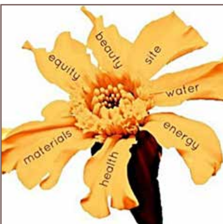
Living Building Challenge petals.