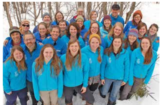
Program and graduate naturalists 2016.

Though the core remains the same it's really quite amazing how complex the program has become. As we know from the science of ecology, diverse and interconnected systems are key for stability. Building year after year upon the successes and inspirations from previous Wolf Ridge alumni, we can only marvel at what must be in store for us in the coming years. Thank you to everyone who has contributed to these amazing developments. ♦