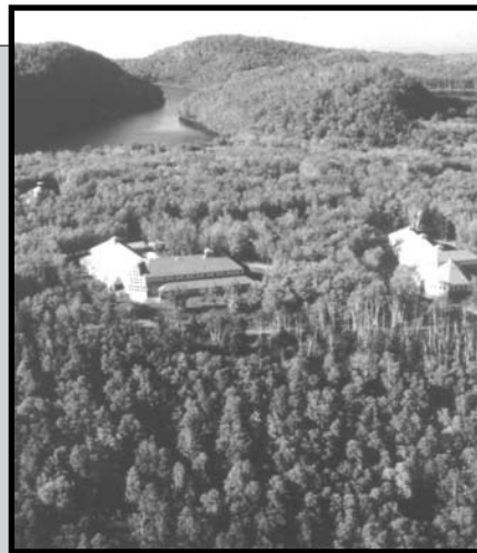
Wolf Ridge Campus