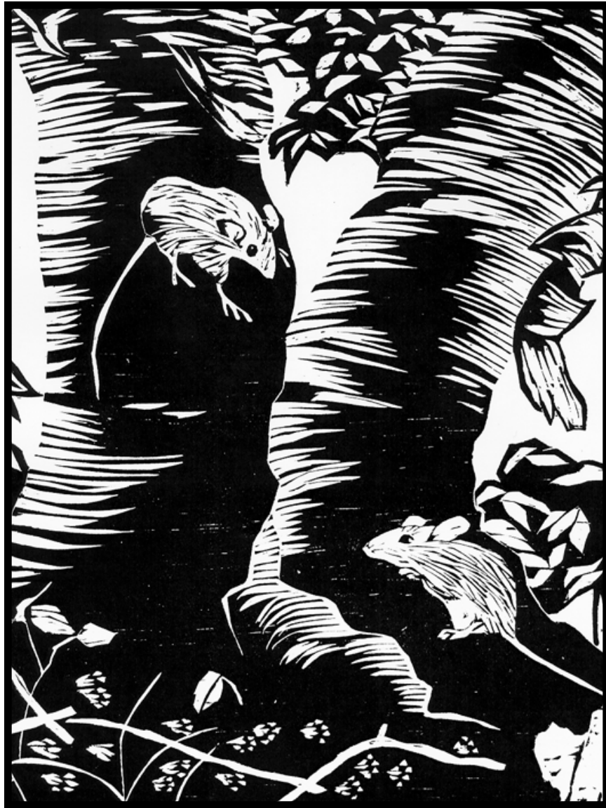
"Deer Mice" Block Print by Betsy Bowen

Wolf Ridge Environmental Learning Center 6282 Cranberry Rd, Finland, MN 55603 • 800-523-2733 (MN, WI) • 218-353-7414